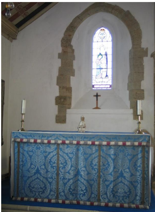
The Lady Chapel, known in earlier times as the Onley Chapel