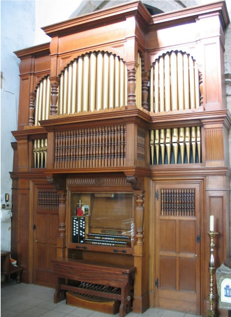
Organ made in 1895 by Bryceson Bros Ltd of London