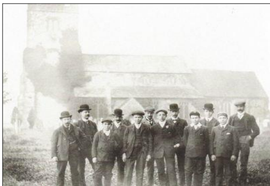
St Mary's Bell Ringers 1907

'NB. All ringers that use this belfery (sic), The Sexton fees do not deny, For if the bell you overthrow, Pay down 6d, before you go. Pull off your hat and gloves lay by, Or pay down 6d immediately, And if you take God's name in vain, Pay down 1/0 for your pains. Beware of this whenever you ring. GOD SAVE THE KING'.