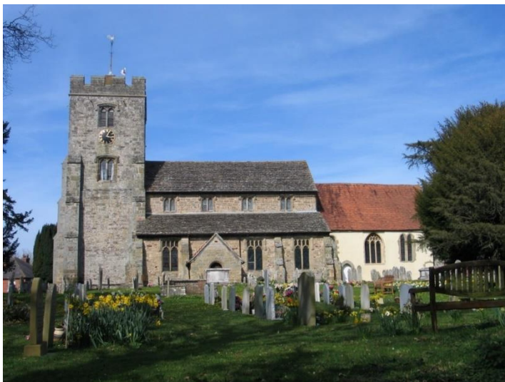
St Mary's Tower, Nave and Chancel from the South side of the Churchyard

This 2021 edition was updated at the time of the 800 th anniversary of the building of the earliest parts of the church