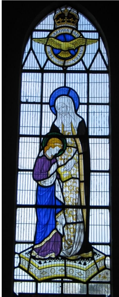
Lady Chapel East Window, depicting St Anne and the young Virgin Mary