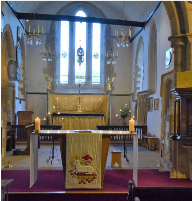
The Nave Altar and Chancel (Candlemas 2021)