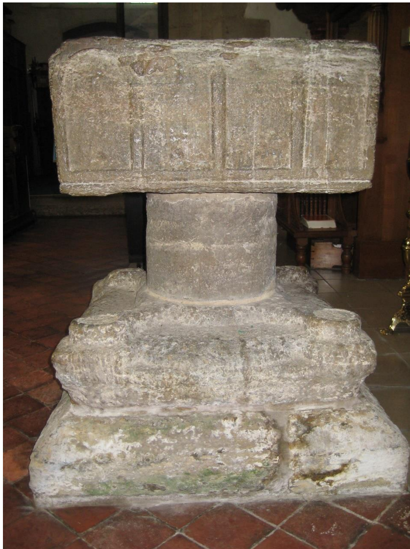
Norman font, moved from beneath the tower in 1957